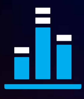
Big Data Analytics (27.8% CAGR¹)